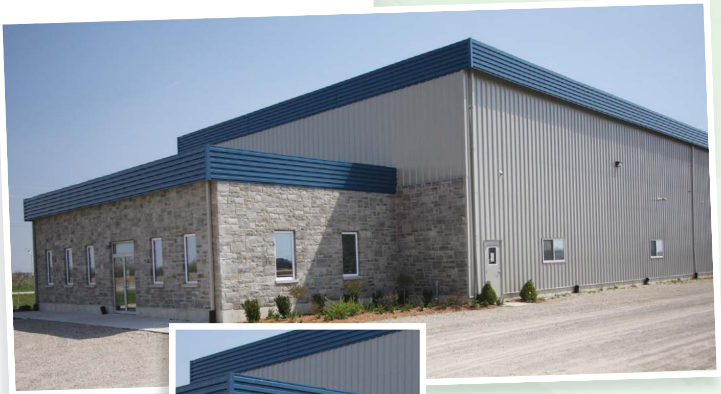
The Heron Blue StrucSeal parapet band creates an attractive accent on this Stone Grey StormSeal building.